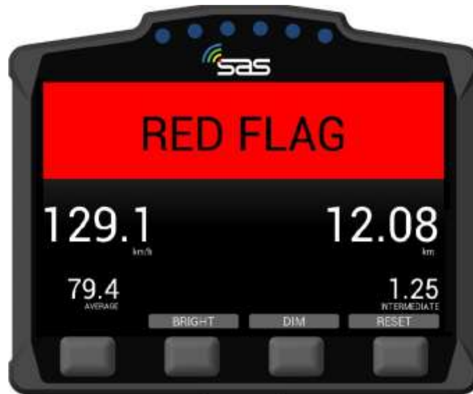
SCREEN 11. RED FLAG in Stage Mode

SCREEN 11 – Once the red flag has been acknowledged, normal stage functions will display with a warning still at the top of the screen.