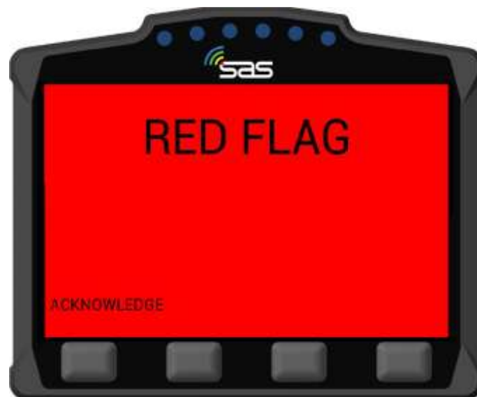
SCREEN 10. RED FLAG Acknowledge

SCREEN 10 – In the case of a serious incident, a stage may be red flagged from Race Control. The red flag will display a full screen warning until it is acknowledged. To acknowledge the flag the far left button must be pressed.