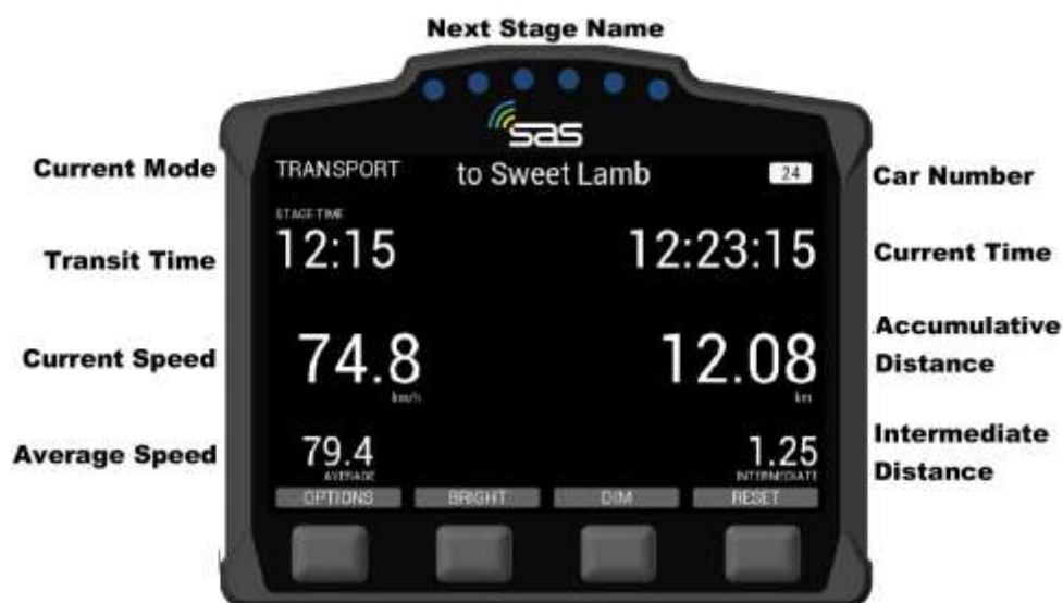
SCREEN 1. Transport Mode