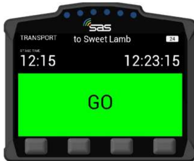
SCREEN 3. Stage Start

SCREEN 3 – Once the start time is reached, the screen will turn green as shown below and the competitor has to proceed into stage.