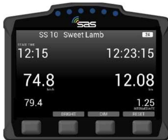
SCREEN 4. Stage mode

SCREEN 4 – Once the competitor has started the stage, the unit will automatically switch to on stage mode. The unit will start timing.