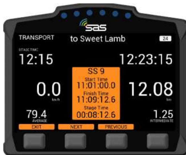
SCREEN 14. Times of completed stages

SCREEN 14 – By pressing the “VIEW TIMES” button, provisional transit and competitive stage times will display. You can select times for any of the completed stages with the next and previous buttons.