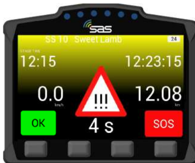
SCREEN 6. HAZARD Notification

SCREEN 6 – If a car stops during a stage for longer than 3 seconds, the unit will automatically transmit a HAZARD notification; this can either be upgraded to OK or downgraded to SOS by pressing the corresponding button to the text. A timer counts up to 60 seconds as an indication to press either the OK or SOS button.