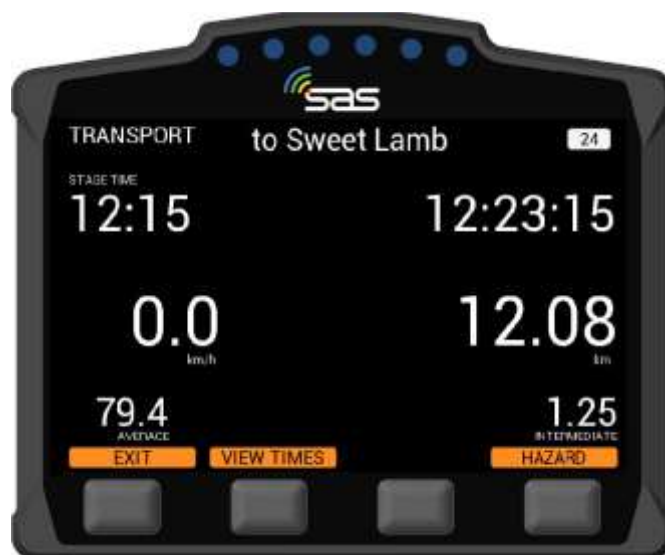
SCREEN 13. Transport Mode – View times/Send Hazard

SCREEN 13 – The option menu will allow the crew to view stage times “VIEW TIMES” or send a manual hazard/SOS “SEND HAZARD”.