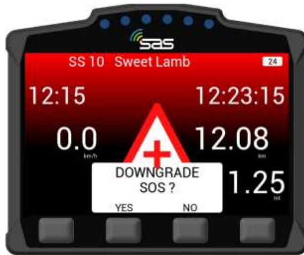
SCREEN 9A. Downgrade SOS

SCREEN 9A – If you select the cancel button on the SOS screen, you will be asked to confirm the downgrade. Once confirmed, the device will downgrade to an OK status.