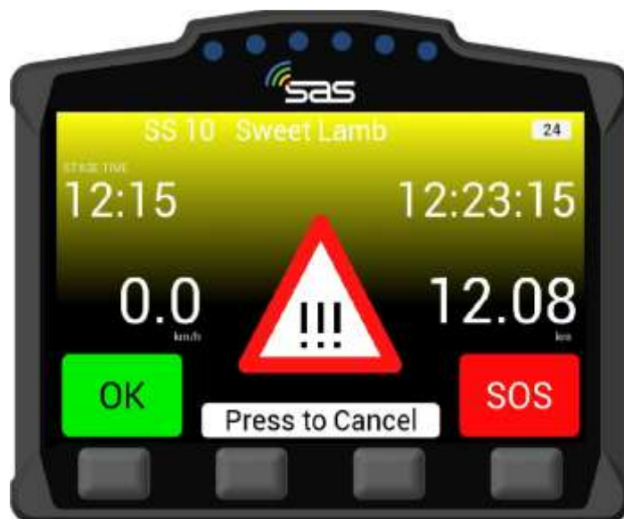
SCREEN 15. Manual Hazard in Transport Mode

SCREEN 15 – If manual hazard is sent in transport mode, this can be upgraded or downgraded the same way as a stage hazard. If the hazard is no longer required, it can also be cancelled by pressing either of the two middle buttons “PRESS TO CANCEL”.