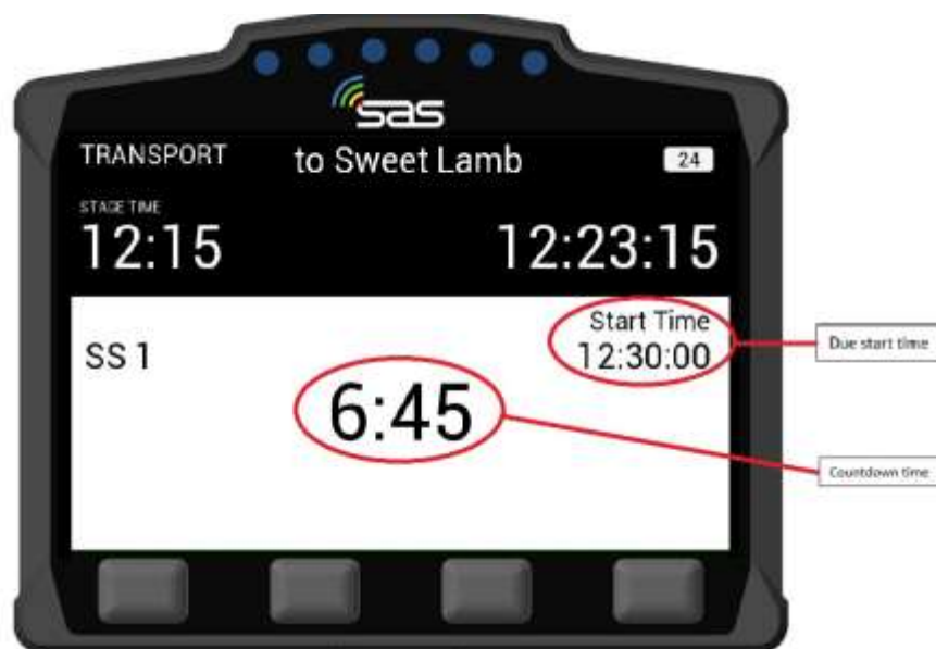
SCREEN 2. Countdown to Stage Start

SCREEN 2 – When the start official assigns each individual competitor a due start time, a countdown will display on the unit as shown in the white field below. Also shown in the white field is the stage number and the due start time.