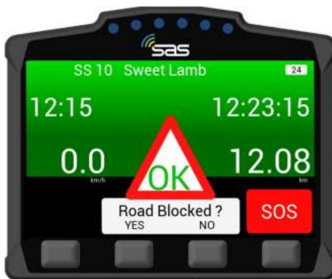
SCREEN 7. OK Acknowledgment

SCREEN 7 – If you select OK after the HAZARD alert, then the following screen will appear, showing that you and the car are OK. The Road Blocked prompt will appear below, select Yes if the vehicle is blocking the road, if the road is clear select NO.