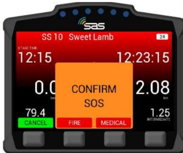
SCREEN 8. Confirm Fire SOS or Medical SOS

SCREEN 8 – If the SOS button is pressed, it must be confirmed as either a fire or medical SOS by pressing one of the two middle buttons. It can also be cancelled if pressed by mistake.