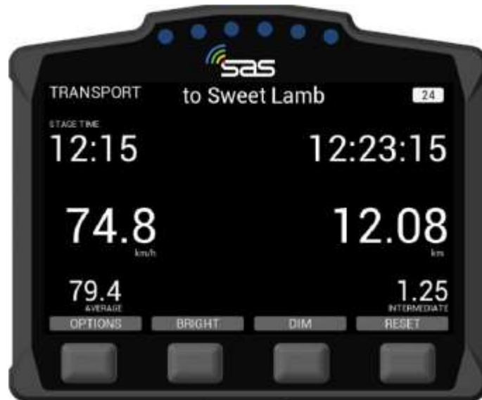
SCREEN 5. Start Time Cancelled