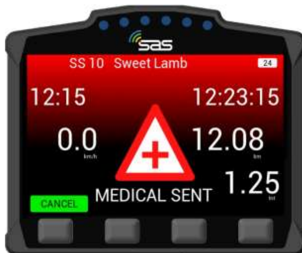
SCREEN 9. Downgrade SOS

SCREEN 9 – When the SOS is confirmed, the screen 9 will display. Even once confirmed, the hazard can be changed to OK. Pressing CANCEL and confirming the downgrade will inform race control that the crew are OK and do not need medical assistance.